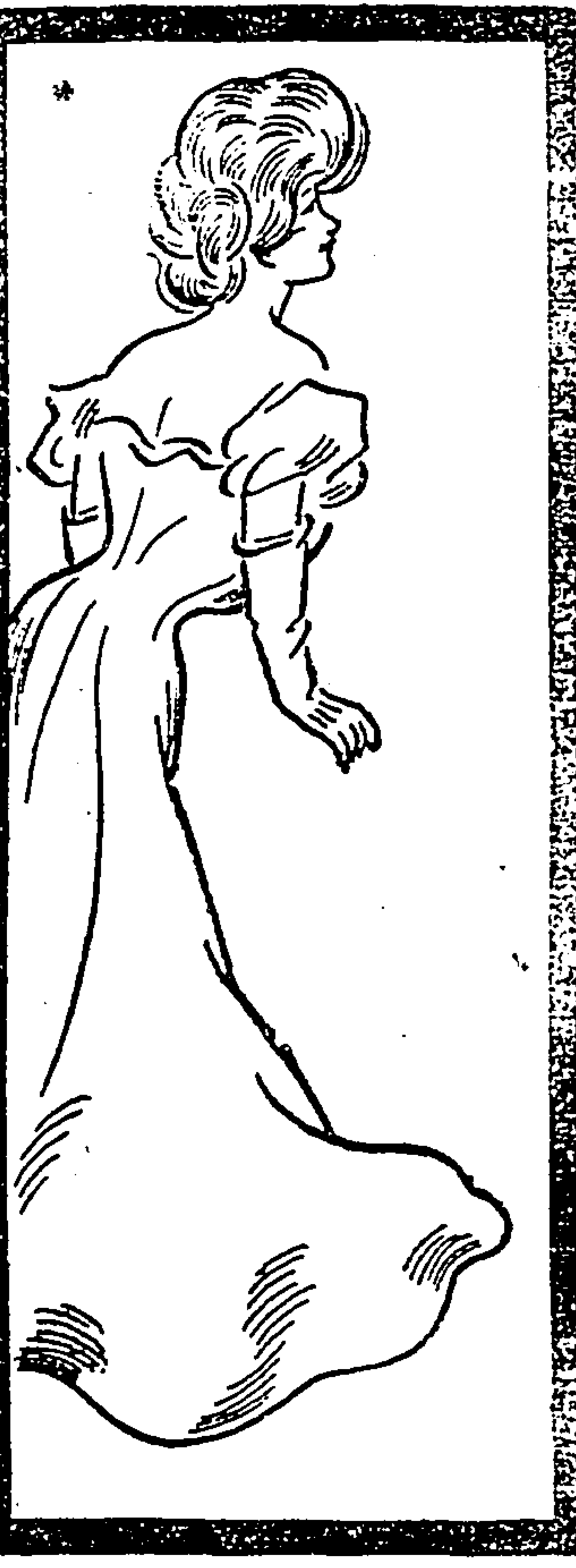
An Enjoyable Afternoon